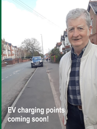
EV charging points coming soon!

EV charging points are coming to a stretch of Copthorne Road. This will help residents without off-street parking in the area to convert to electric vehicles.