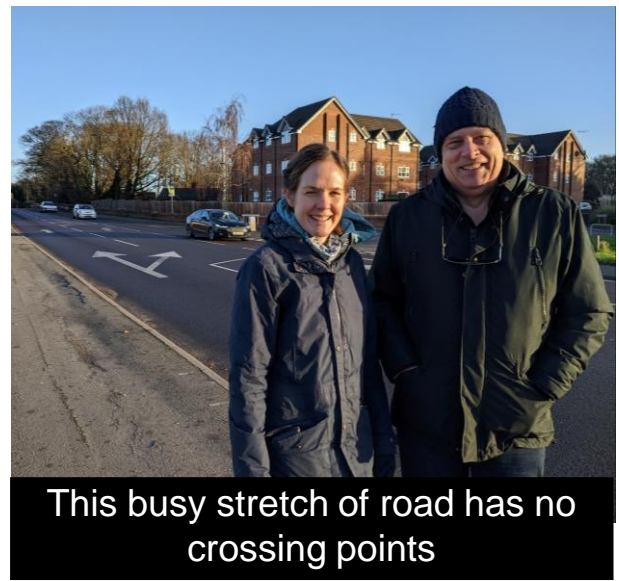
This busy stretch of road has no crossing points

We're pressing the planners for a new crossing on Battlefield Road . This is urgently needed; there will soon be 100 new houses in the area, and we know that if the North West Relief Road is built that will also increase traffic . We're also calling for dropped kerbs at crossing points and for proper pavements. People on foot and especially using wheelchairs or pushchairs should be able to get round the area without obstacles.