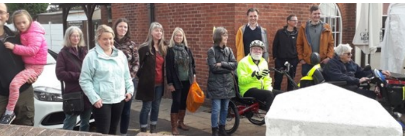
A group from one of the 'walkabouts' looking at the liveable neighbourhood suggestions

It was great to see a huge response to the proposals for improved walking and cycling safety in the area. We met around 200 people at the walkabouts and drop-ins, and received 1000 written and online responses. Many comments were about Copthorne Road. There were also lots of useful suggestions. Meanwhile traffic information has been updated (you may have seen the traffic counters in the local streets). So new proposals are in the pipeline.