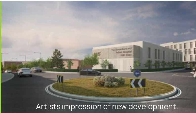
Artists impression of new development.