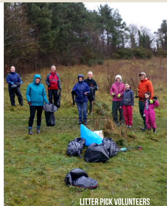
LITTER PICK VOLUNTEERS

Please fill in the short online survey by 6 MAY to support this scheme which makes it safer to walk or cycle to schools and RSH. SCAN THE QA CODE HERE.