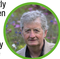
MAYOR JULIAN DEAN

The Green group think we must do things differently. Open discussion of ideas at an earlier stage might improve the budget without a party-political bun fight. We will be making suggestions for a different way to make decisions in the coming months, based on good practice elsewhere.