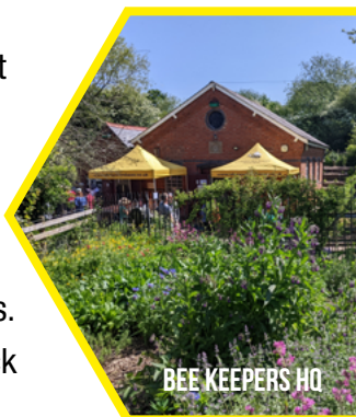
BEE KEEPERS HQ