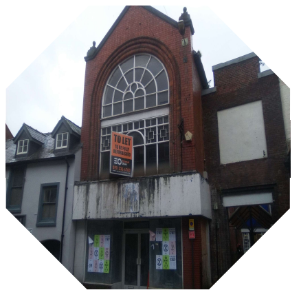
Cross St, Oswestry

We have just learnt that Shropshire Council received £5M for regeneration and decided to spend it all on making improvements to a Shrewsbury shopping centre. It would have been fairer, and would have created more jobs, if this money had been used to tackle the empty shops in Oswestry's town centre.