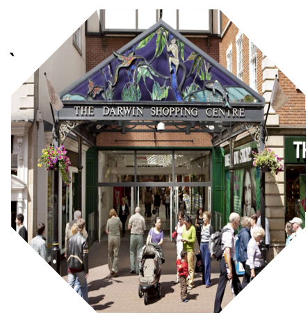
Pride Hill, Shrewsbury

All your Green Councillors are passionate for Oswestry to grow and prosper. We think that with a bit of vision the town could host a national attraction and we are developing several ideas for this. If you have any of your own, please let us know.