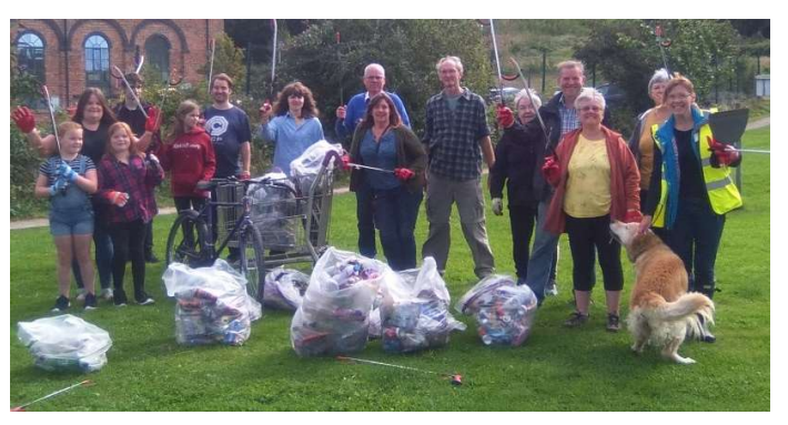
Community Litter Pickers in Action.

After a trial in September we are now able to re-start our community litter picks. The next one will be on Wilfred Owen Green at 2pm on Sunday the 25<sup>th</sup> October. As usual we will gather by the park entrance near to the Cambrian buildings. We will provide gloves and pickers please bring a face covering.