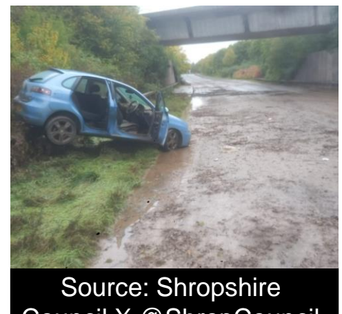
Council X @ShropCouncil

Battlefield Link Road flooded again, as it often does, and the A53 at Battlefield Island was blocked by an overturned lorry. These events are already frequent, and traffic will increase if the North West Relief Road (NWRR) gets built. The Conservatives on Shropshire Council are pushing it through with no plan for the extra traffic on Battlefield Road, the link road and the A49. We strongly oppose the NWRR which will not solve our traffic problems and threatens Shrewsbury's drinking water supplies. We need local solutions, starting with a pedestrian crossing on Battlefield Road.